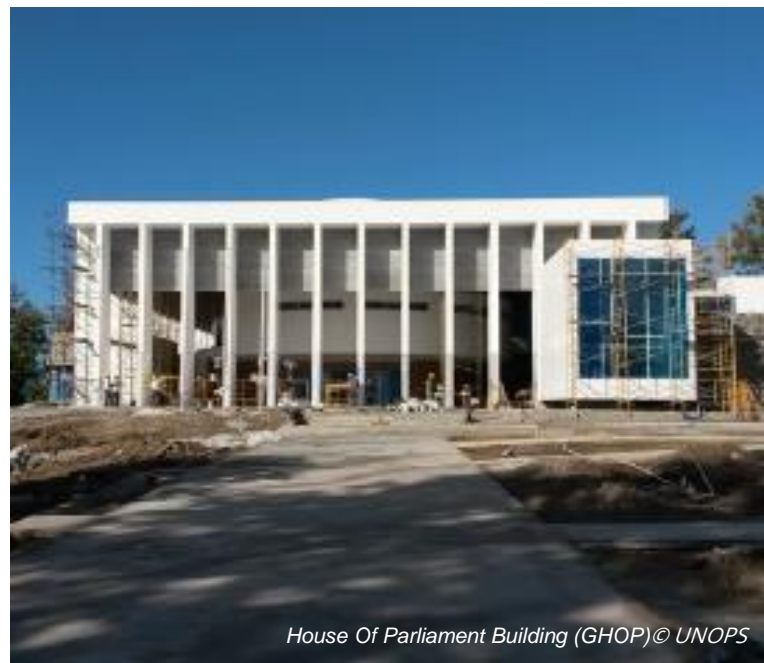
House Of Parliament Building (GHOP)

UNOPS worked with the Government of St. Lucia in developing the capacity and capability of the DCA to provide a “one stop shop” service to developers and investors thereby facilitating responsible development in an efficient and effective manner.