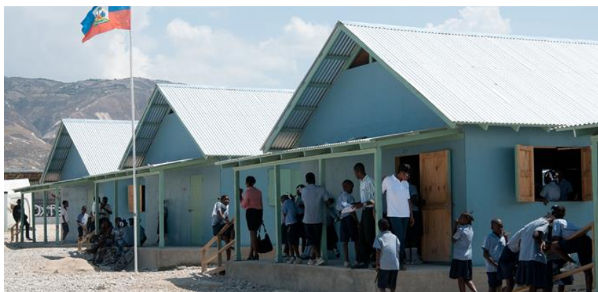
UNOPS services has transitioned from shelter construction to sustainable urban development, road and transportation services, health services, education and support to United Nations organizations in Haiti, among others.